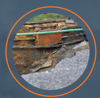
Highways Emergency Response