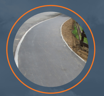
Highways Improvement Schemes